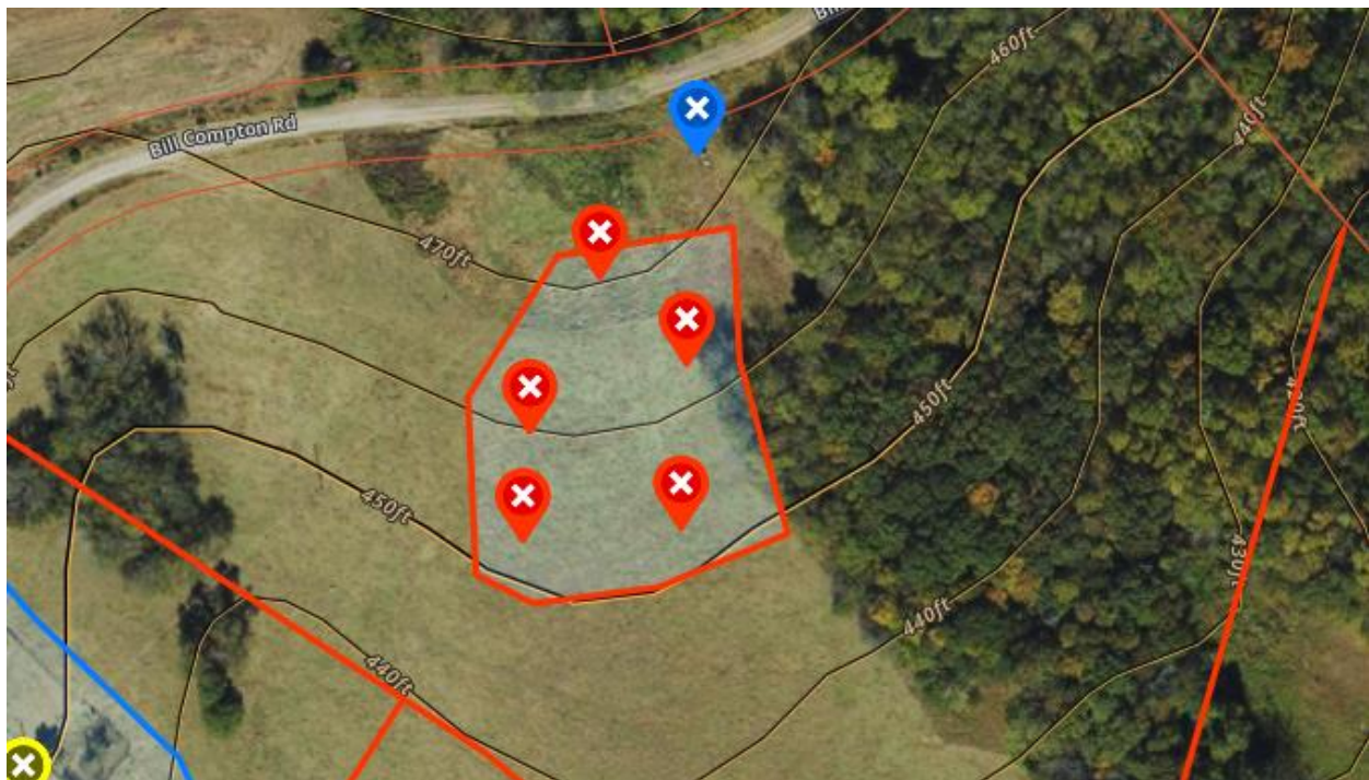
Figure 4. Usable area for a conventional septic system.

The useable area of soils for a conventional septic system was located on a side slope of the main ridgetop. The red outline in figure 4 below is a 0.95-acre (41,382 ft 2 ) contiguous area that surrounds an existing parcel. This is 4 times the area needed for a septic system and repair for a potential 4-BR dwelling. All property line setbacks (10 feet minimum) should be maintained from the suitable area.