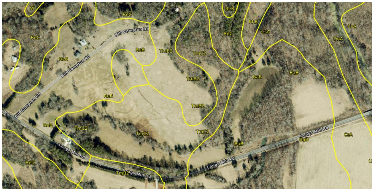
Figure 2. Soil map of the of the subject property (SoilWeb).

The 10-acre lot lay in the Piedmont physiographic province. Three soils mapped on the property were the Tomlin (TmC2) soils (Figure 2). The Tomlin soils are typically suitable for conventional septic systems. The site had several fields in open pasture.