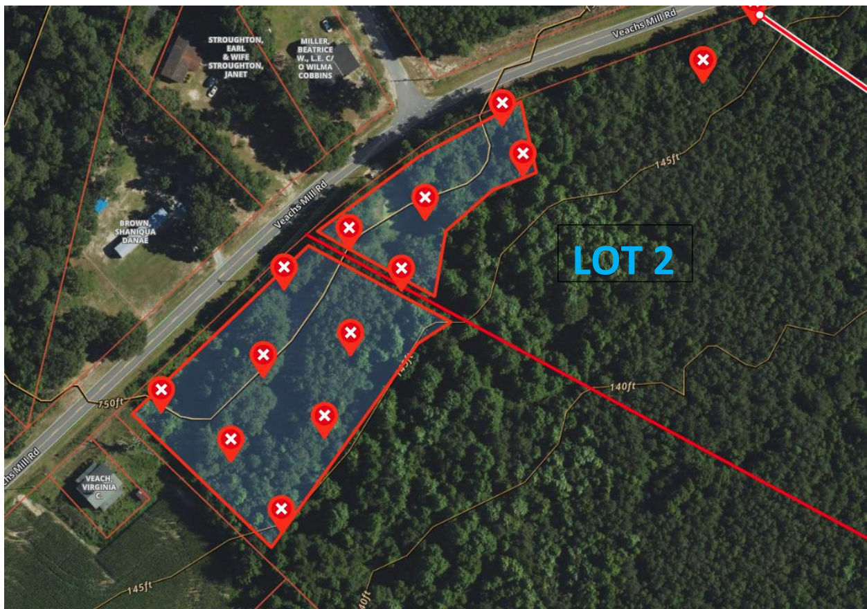
Figure 3. Soil boring locations within the lot as located by the onX Hunt application.

The recommended LTAR (long term acceptance rate) for the Autryville soils would be 0.6 gallons per day per foot squared (GPD/ft 2 ).