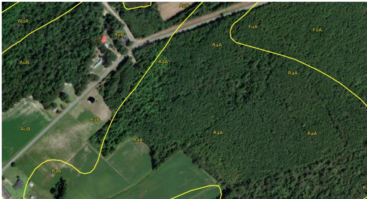
Figure 2. Soil map of the of the subject property (SoilWeb).

The 47-acre tract was off Veachs Mill Rd., Waraw, NC (figure 1) was proposed to be split into different lots. The site lies in the lower Coastal Plain region. There was one mapping unit of interest for exploration for my site visit in the NRCS soil map, AuB, Autryville loamy sand. The Rains Soils are totally unsuitable and therefore were not evaluated.