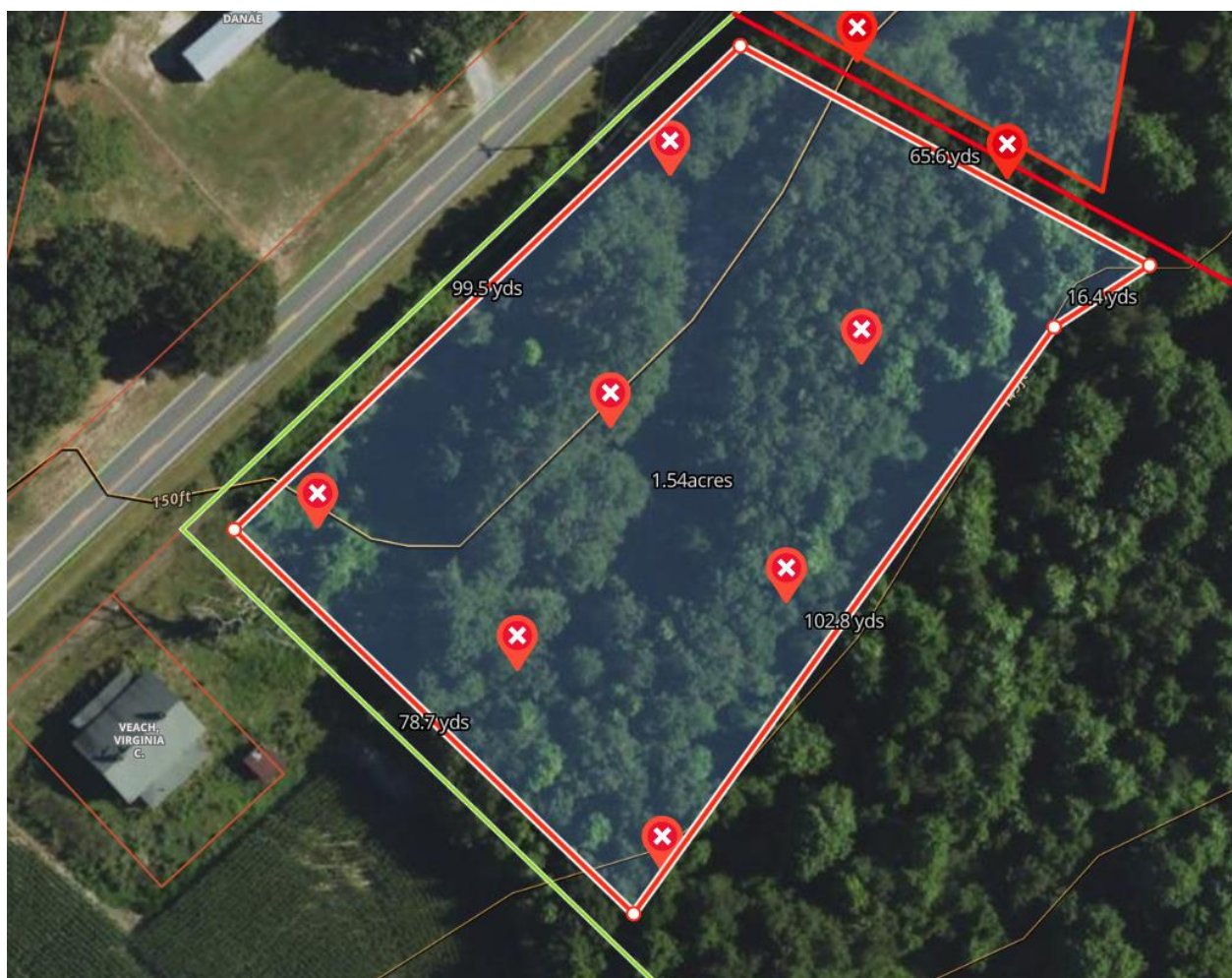
Figure 4. Usable soil area.

There was an area of suitable soil for the potential installation of a conventional septic system adjacent to the road. This area was located on a gently sloping ridgetop. It was 1.54 acres, or 67,082 ft 2 . This would be over 13 times the minimum space needed for a potential drainfield and repair for a 4-BR dwelling (see red outline figure 4).