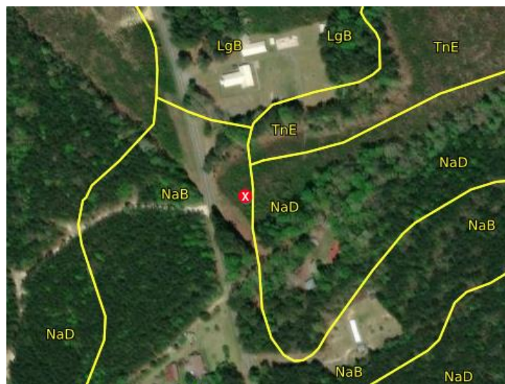
Figure 2. Soil map of the of the subject property (SoilWeb).

The 10.91-acre tract was off of Pine Grove Church Road near Eagle Springs, NC (figure 1). The site lay in the Carolina Slate Belt region. There was one mapping unit of interest in the NRCS soil map, NaB, Nanford soils (figure 2), which are marginally suitable for conventional septic systems. A power transmission line was present in the front of the property.