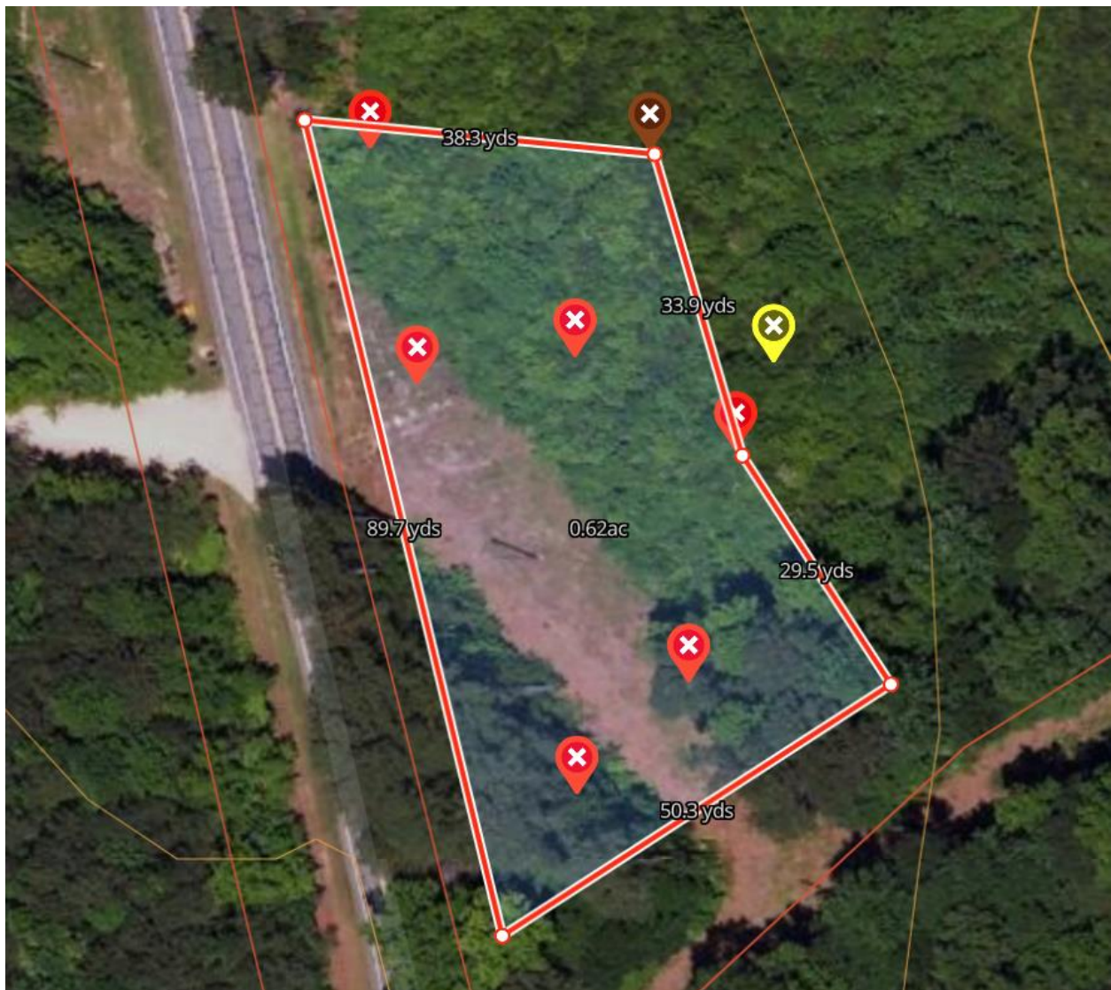
Figure 4. Usable soil area.

All soil observations would support a potential installation of a conventional septic system. The usable area was 0.62 acres, or 27,007 ft 2 . This would be over 2.7 times the minimum space needed for a potential drainfield and repair for a 4-BR dwelling (see red outline figure 4). The highlighted red area is located on an upland summit. The powerline is in the cleared brown area below.